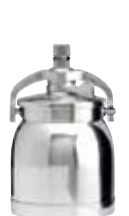
PCL 7B2 #6019 700ml Aluminum

High performance, compact and lightweight siphon fed HVLP spray gun.