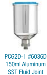
PCG2D-1 #6036D 150ml Aluminum SST Fluid Joint